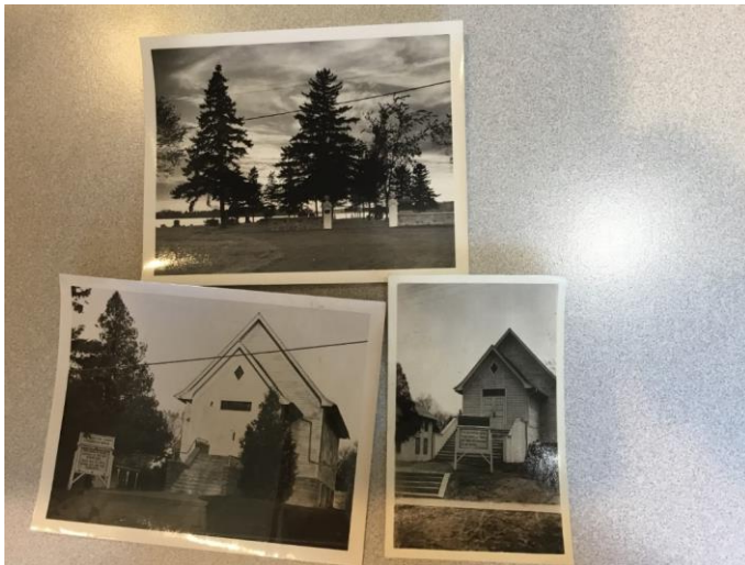
Old photos of the Unitarian Church of Underwood Shared from a member of the Unity Church Unitarian in St. Paul