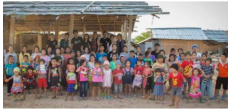
Shan School Students, Thailand