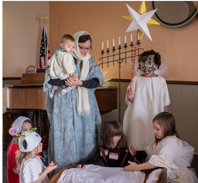
Children's RE Program Players, 2018