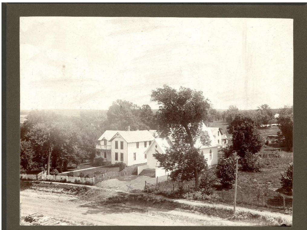
Unitarian Church of Underwood parish on the north and church probably taken around 1950 because it appears there is excavation going on for the Rolfson steps installed about that time.